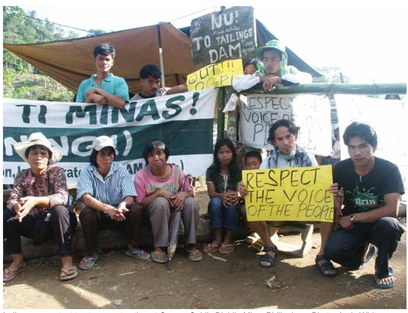
Indigenous protest to stop construction at OceanaGold's Dipidio Mine, Philippines.

In the Filipino context, environmental, social and human rights impacts resulting from poor mining practices, both historical and contemporary, have undermined the industry's reputation. This presents challenges for companies committed to responsible minerals development when seeking to gain FPIC in the country. Where a mining project has been in development over a long period and the companies involved have changed, the current implementers may face legacy issues arising prior to their involvement. This is particularly true in cases where there is a history of opposition by parts of the community. Communities may also be concerned about the status of past agreements, or may wish to reconsider or renegotiate with the current proponents.