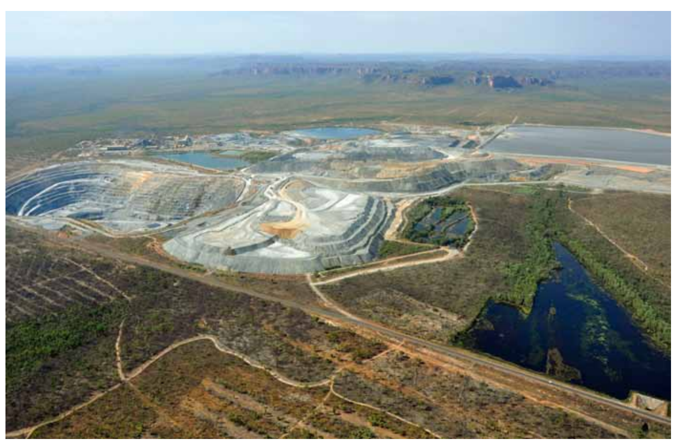
Ranger Mine surrounded by Kakadu Nationl Park World Heritage Area.

the rule of law in a first world economy, a pro-mining government can nonetheless defeat the intent of beneficial legislation by bringing unconscionable pressure on both industry and on the statutory agencies such as the Northern Land Council to deliver an economic outcome. This was an example of consent that was neither free nor informed at the local level. The complaint in relation to the Northern Land Council is that the bureaucracy usurped the resources, capacity and representation of the Traditional Owners. The Mirarr were excluded from being a party in their own right to the 1982 agreement. The 2005 agreement with ERA was entered into by the Mirarr directly. Neither the government nor the Northern Land Council was closely involved although both were required to tacitly approve of the agreement.