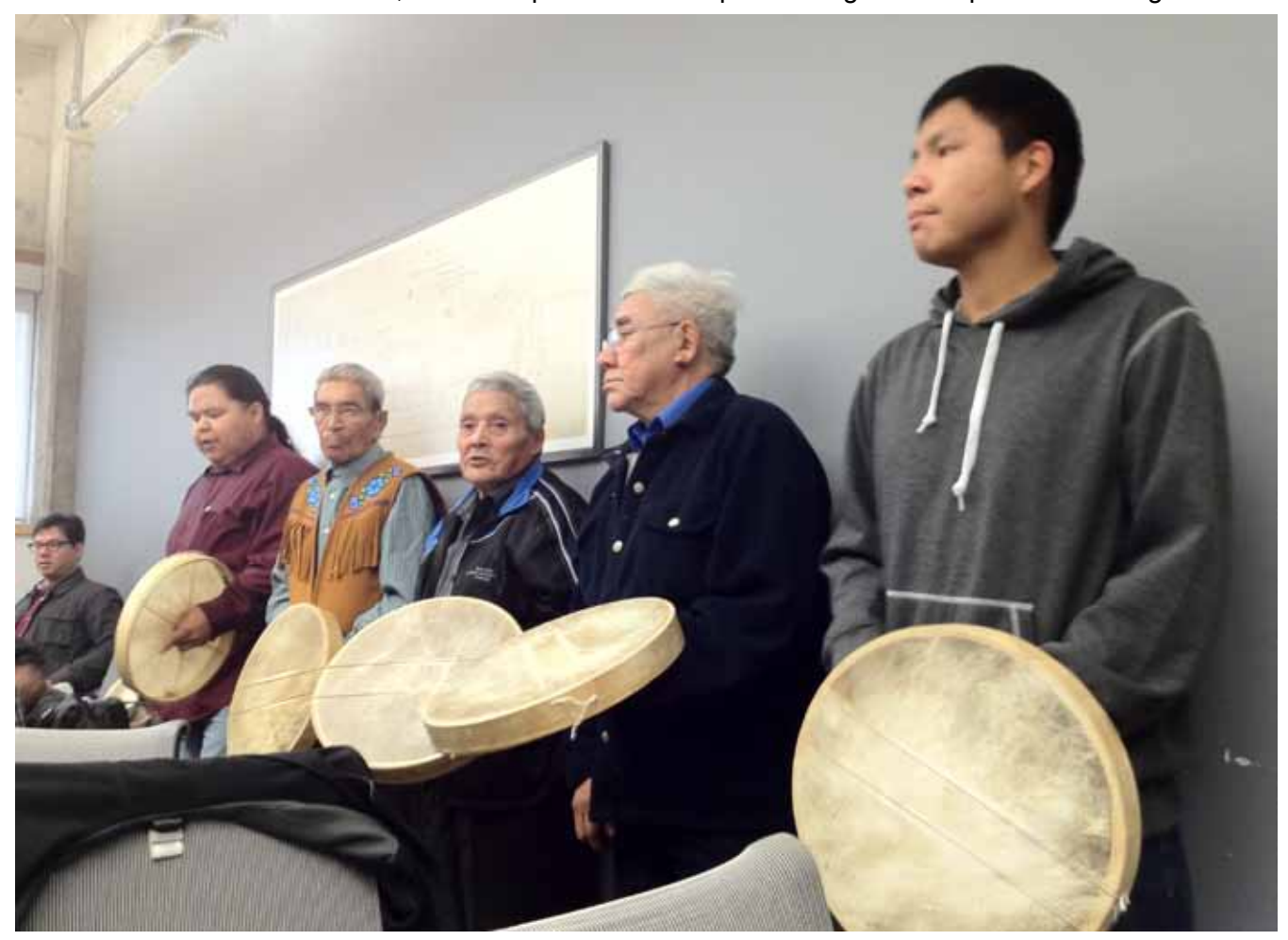
Tłicho elders and youth, drumming and singing, during a university visit to present Tłicho research interests.

The Tłįicho Nation, are neighbours of the Lutsel K'e Dene. They hold a Land Claim and Self Government Agreement, which was negotiated over a 12 year period and covers an area of 39,000 sq kms which is held in fee simple. 138 It is the first combined land, resource, and self-government agreement in the North West Territories, 139 and requires that companies negotiate Impact Benefit Agreements