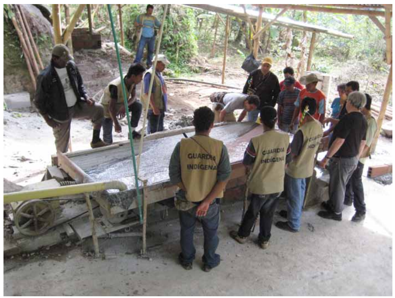
The Resguardo's Indigenous guard – here seen learning about the Resguardo's mining processes -- holds the special responsibility of patrolling the territory and ensuring that the Resguardo's consent protocol is enforced.

The Resguardo communities became aware that mining concessions had been granted in their territories following helicopter exploration flyovers conducted by Canadian junior Colombian Gold Field, without the consultation or consent of Resguardo authorities. Two years ago, alleged representatives of Canadian company Medoro Resources (now merged with Gran Colombia Gold) entered the Resguardo territory and attempted to take some samples, but were detained by the Resguardo's indigenous guard and did not return. On further investigation of the status of mining concessions in their territories the Resguardo communities discovered that all of their territory was effectively covered by mining applications, with 48 concessions already issued, one of which belonged to Anglo Gold Ashanti. Anglo Gold Ashanti have subsequent committed to obtaining the communities' consent prior to commencing any operations and suggested that they should ensure their territories are registered on the government official geological maps.