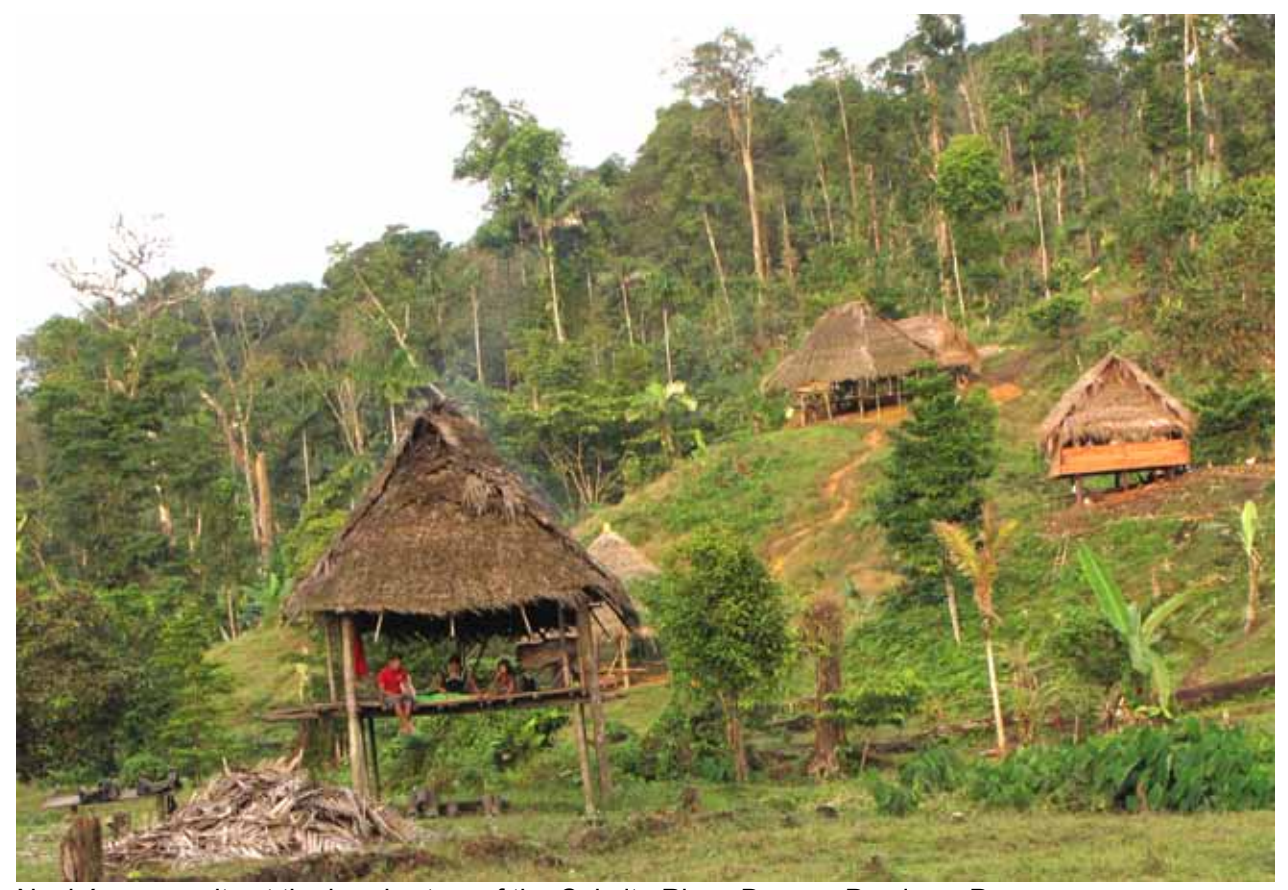
Ngöbé community at the headwaters of the Caimito River, Donoso Province, Panama.

Interviews were held with the above mentioned companies with the objective of clarifying concerns and perspectives in relation to the principle of FPIC and its operationalization. The issues raised in the interviews can be divided into two broad categories. The first relates to FPIC in corporate policy and the drivers for its future inclusion. The second relates to the operationalization of FPIC in practice and addresses corporate perspectives on definitional ambiguities as well as challenges to and potential mechanisms towards its operationalization. The interviews sought to focus on tangible examples where these challenges were encountered as well as practices which the companies regarded as facilitative of FPIC operationalization.